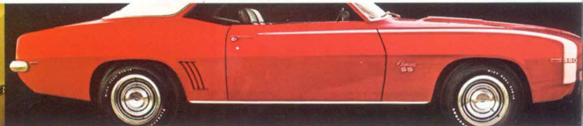
The Camaro SS from the side.