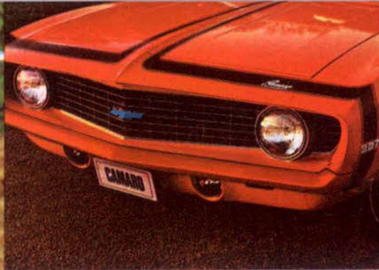
Color-Matched bumper and front accent striping.