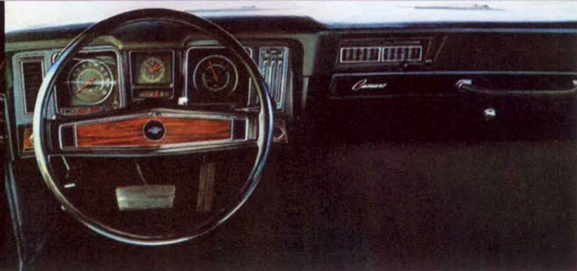
Instrument panel and Special Interior Group.