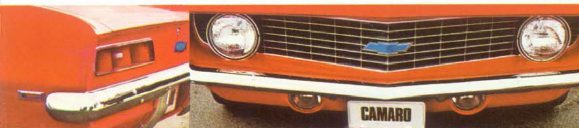
Camaro, from the rear.