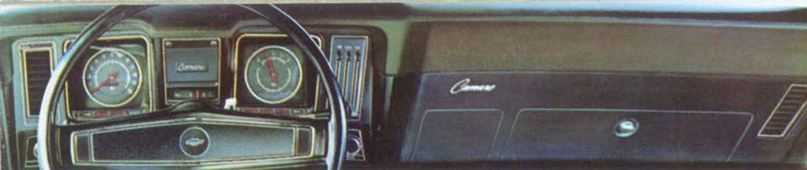
The command post.