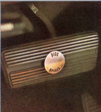
Power disc brakes.