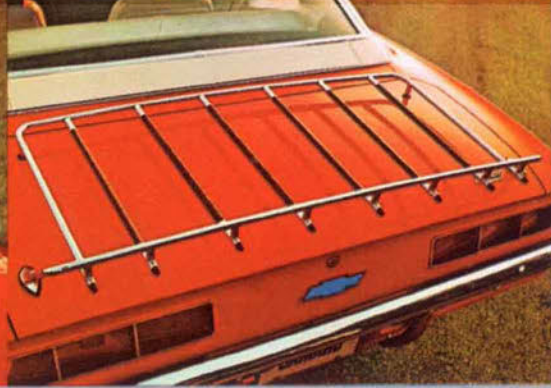
Rear deck luggage rack.