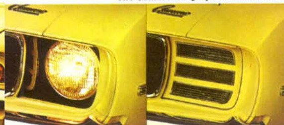
Concealed headlights, open. Concealed headlights, closed.