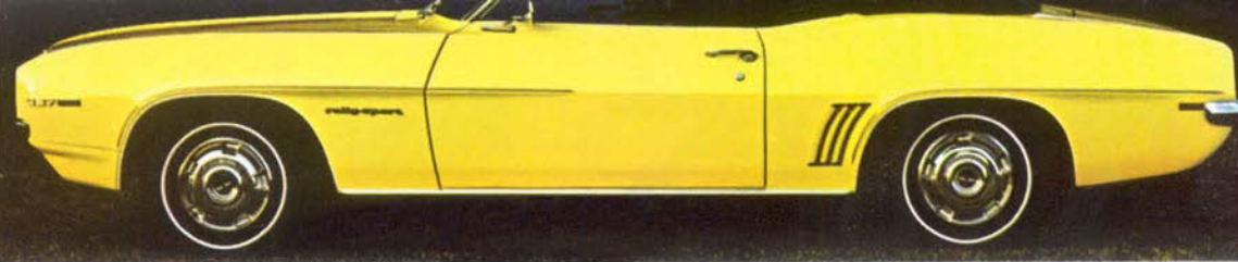
The Camaro Rally Sport from the side.