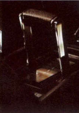
Powerglide with console.