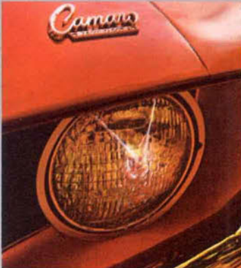
Headlight washer option.