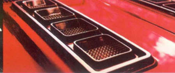
SS hood with simulated ports.