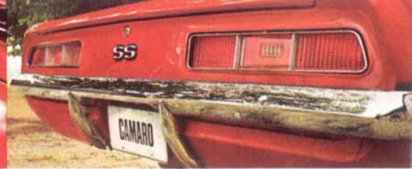
Rear trim on the SS.