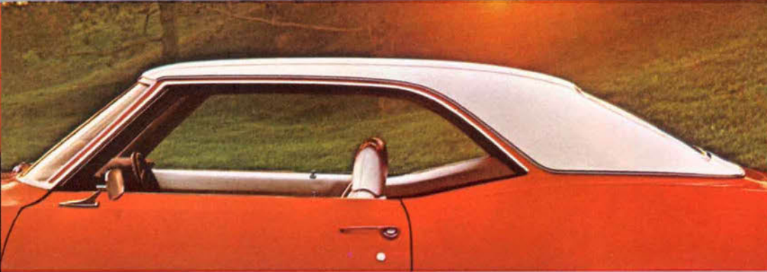
Vinyl roof cover with a new styling touch.