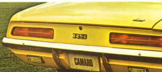
The Rally Sport's rear trim.