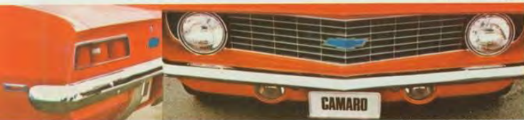
Camaro, from the rear.