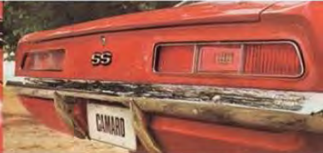
Rear trim on the SS.