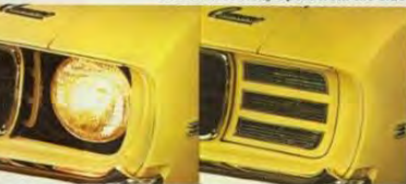
Concealed headlights, open. Concealed headlights, closed.