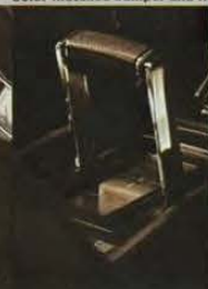
Powerglide with console.