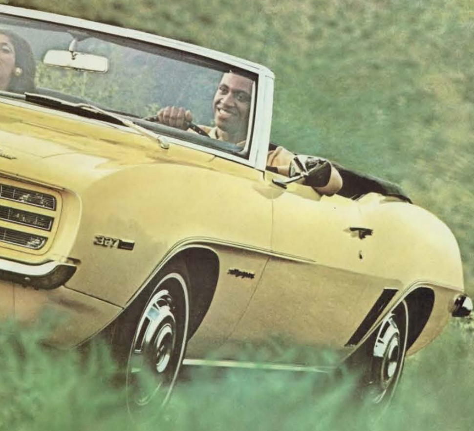
Camaro Convertible with Rally Sport equipment.