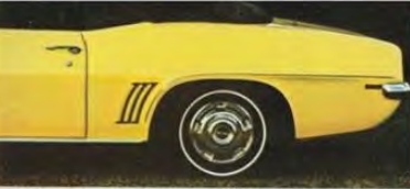
The Camaro Rally Sport from the side.