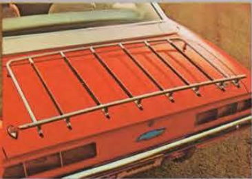
Rear deck luggage rack.