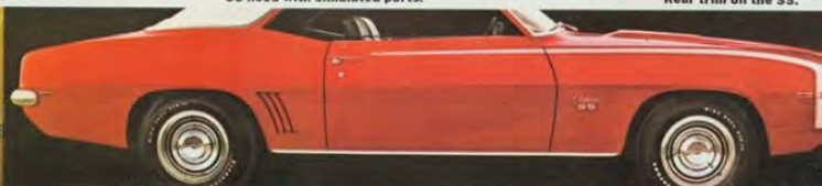
The Camaro SS from the side.