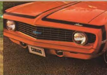
Color-Matched bumper and front accent striping.