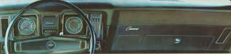
The command post.