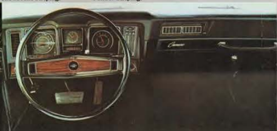
Instrument panel and Special Interior Group.