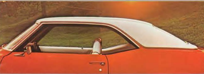
Vinyl roof cover with a new styling touch.