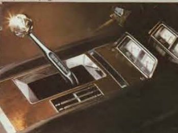
4-Speed transmission with a Hurst shifter and Special Instrumentation on console.