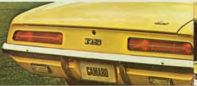
The Rally Sport's rear trim.