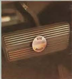
Power disc brakes.