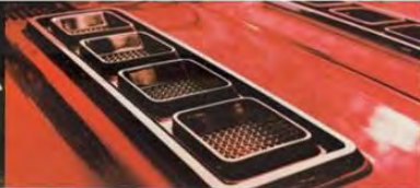
SS hood with simulated ports.